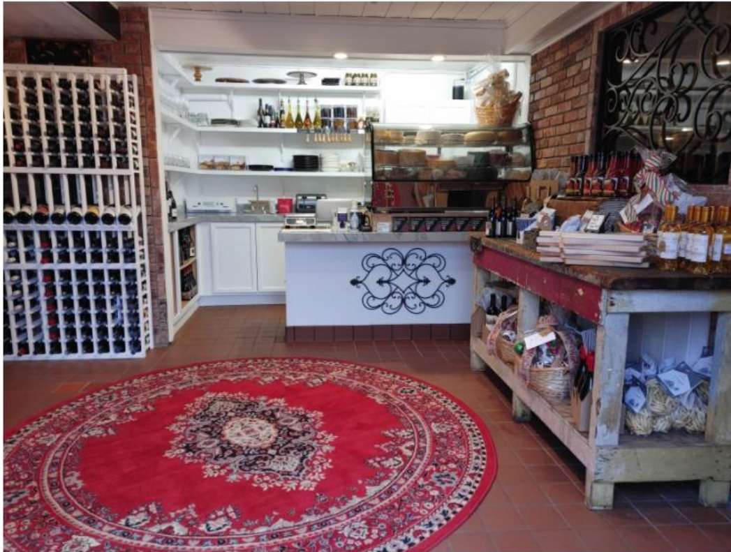
Inside the new Cork & Knife in Rancho Santa Fe.